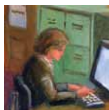
. . . or home