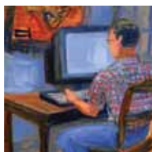
At your office . . .