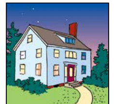
... or home