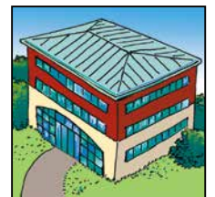
At your office ...

PROS: Live digital feed and 24/7 Internet access for the next six months; accessible in the office, at home or anywhere worldwide with Internet access; avoid travel expense and hassle; no time away from the office.