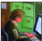
At your office ...

PROS: Live digital feed and 24/7 Internet access for the next six months; accessible in the office, at home or anywhere worldwide with Internet access; avoid travel expense and hassle; no time away from the office.