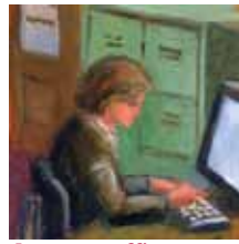
At your office . . .