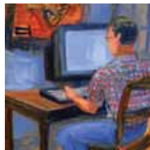
. . . or home